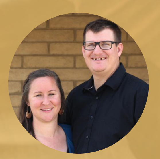
The Irvines CHURCH PLANTING INTERNS

11611 N. 51ST AVENUE. GLENDALE, AZ 85304